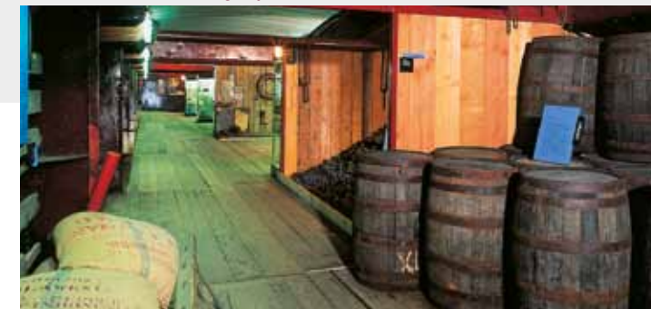
Cargo bay in the museum boat 'Franz-Christian'

This was an engineering triumph. Because of the incredible technical achievement boats were able to move quickly and efficiently 14 metres up and down between the two levels of the canal. If you want to find out exactly how the ship lift worked you can try your hand at a model in the boiler and engine house in the museum. This was where the electricity needed to drive the ship lift was once produced by steam engines .