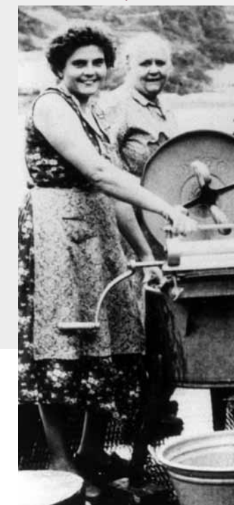
Washday on board

mantic. The tiny cabins in which the families cooked, slept and ate will give you a vivid impression of the lack of space under the deck. On the 'upper water' the harbour scenery is typical of the time around 1900. The 'Ostara' barge is tied up at the quay alongside other historic boats. From time to time there are special exhibitions in the loading room on the barge. The revolving crane, the flap gate and the lift bridge are all original historic features.