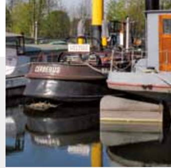
Historic boats in the upper water