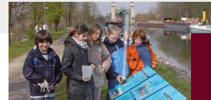
Discovering the canal

There are plenty of things to discover on the upper water. To name but one example: here the children can find out what life and working conditions were like for a ship's boy many years ago. Boys and girls can go aboard an old barge and test for themselves how boats used to be loaded and unloaded.