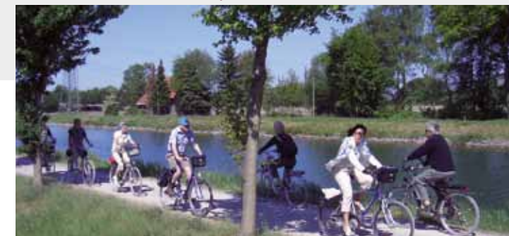
Cycle tour on the canal

Useful internet addresses: www.waltrop.de www.route-industriekultur.de www.erih.net www.santa-monika.de www.santamonika.de