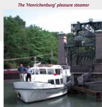
The 'Henrichsburg' pleasure steamer