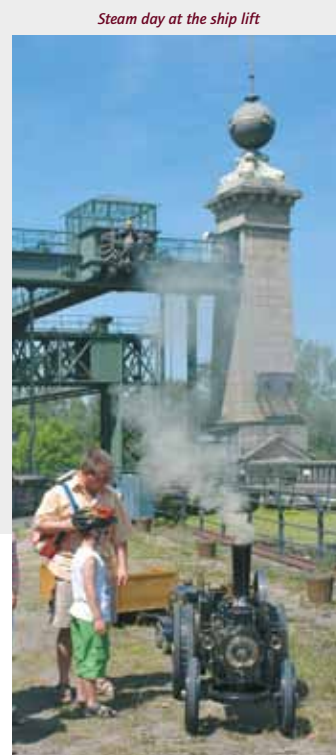
Steam day at the ship lift

You can find all the dates you require on the internet. Or simply request our Calendar of Events .