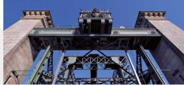
Imposing industrial monument

replaced by a modern ship lift in the immediate vicinity. After its closure the splendid old construction fell into a state of dilapidation until the regional authority decided to take it over and restore it as one of its sites belonging to the Westphalian Industrial Museum. In 1995 the ship lift was awarded the European Museum prize .