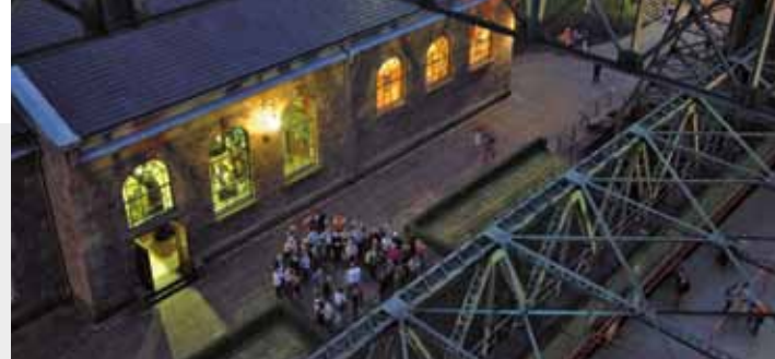
An evening tour through the illuminated ship lift