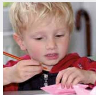
Building a boat