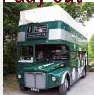
The 'gastro bus'

Our gastronomy bus - a London double-decker built in 1959 - offers visitors a small selection of snacks and drinks. When the weather is fine you can sit outside