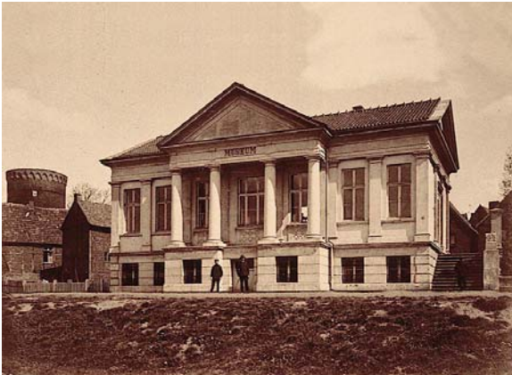
The last place the inscription was seen: The Römisch-Germanische Museum Haltern.

The LWL-Römermuseum can show only a copy of the inscription in its exhibition. The stone, which was found at the beginning of the 20 th century by a well on the castle hill of Pergamon, was long thought of as lost.