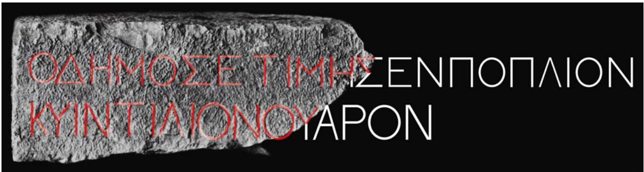
Reconstructed inscription: „The people (of Pergamon) honor Publius Quin(c)tilius Varus“. From: K. Tuchelt, 1979, Frühe Denkmäler Roms in Kleinasien. Processing: LWL/Esch

The LWL is presenting some of the more than 200 world-class exhibits in a series: