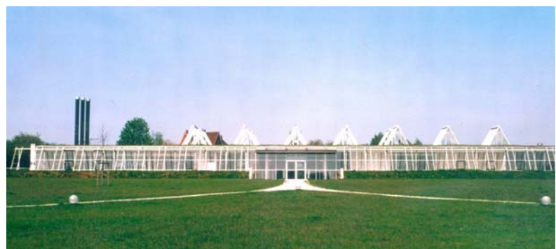
The successor: the LWL-Römermuseum in Haltern am See.

Further research showed that the stone was indeed a present given by the Imperial Ottoman Museum in Istanbul to the Römisch-Germanisches Museum in Haltern, precursor of the LWL-Römermuseum. Alexander Conze, who headed the excavations at Pergamon