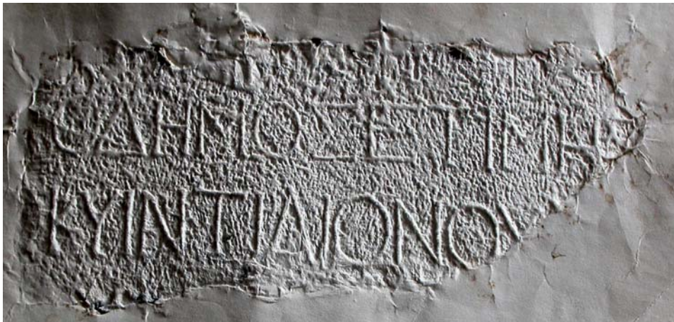
Copy of the inscription from Pergamon in honor of Varus.

Under Emperor Augustus the Roman Empire 2000 years ago was at the height of its power. The rise of Rome to a power which dominated the whole Mediterranean area is shown by the LWL-Römermuseum in Haltern am See in its new exhibition "IMPERIUM" (16.5.-11.10.). The exhibition organised by the Landschaftsverbandes Westfalen-Lippe (LWL) is part of the exhibition project „IMPERIUM KONFLIKT MYTH. 2000 Years Varus Battle“. It spotlights Augustus' political achievements and the cultural riches of his "Golden Age". The exhibition presents a picture of the man who was defeated in the Battle in the Teutoburg Forest that does away with the widespread image of Publius Quinctilius Varus as a failure.