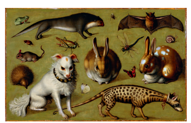
Ludger tom Ring the Younger, Animal Painting with a Genet, circa 1560.

The permanent collection covers a total of more than 350,000 paintings, sculptures, photographs, drawings and prints, coins and objects, as well as 135,000 books. Around 1,300 exhibits are on display in the 51 exhibition spaces. The museum has achieved international recognition thanks to such highlights as the Soest Antependium, works by the tom Ring family of painters, the collections of expressionists artworks and of contemporary art. Its comprehensive areas of collecting include regional history, the numismatic collection comprising over 100,000 objects, the Diepenbroick portrait archive of over 120,000 portraits using various printing techniques, as well as the Skulptur Projekte Archives.