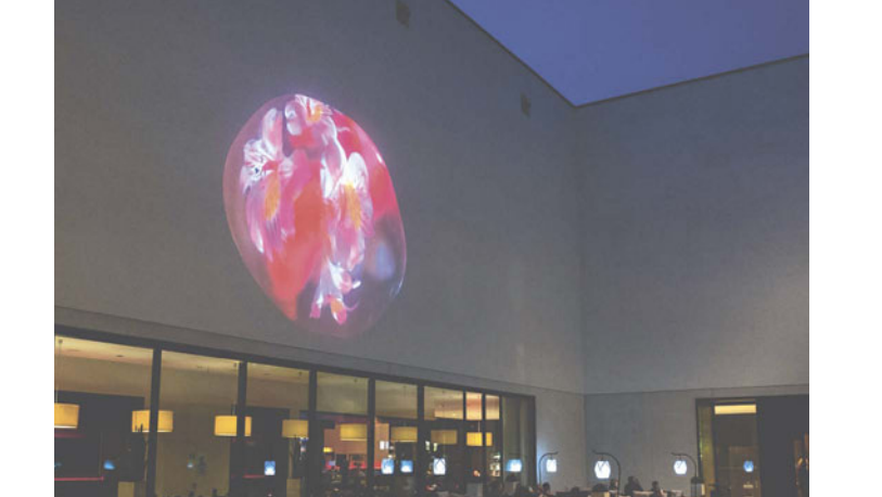
Pipilotti Rist, Münsteranerin, 2014.

Based around the major areas of the museum's collection and issues raised by the exhibitions, the museum welcomes visitors to it as both a place for exchange and for spending time. Guided tours, workshops, artists' talks and other events are developed from the works of art themselves for the most diverse audiences, offering new ways of approaching art. Concerts on a grand or more intimate scale, readings, dance, theatre and film attract the public into the foyer, the Lichthof in the old building as well as into the Auditorium. The museum concept takes into account the special needs of visitors with disabilities both in the inclusive presentation of art and in its public programme. Even without visiting the collection and exhibitions, the museum passage can be used to spend time in the library, to enjoy "Lux", the museum's café and restaurant, and to browse through the Walther König museum shop.